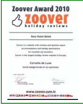
ZOOVER – BEST HOTEL BELEK