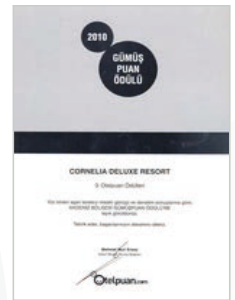
OTEL PUAN – SILVER AWARD