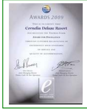
THOMAS COOK - AWARDS for EXCELLENCE