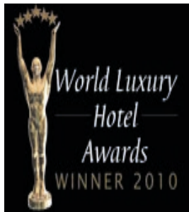
BEST LUXURY COASTAL HOTEL