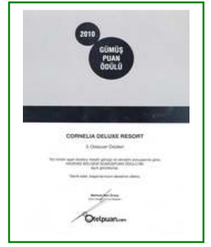
OTEL PUAN – SILVER AWARD