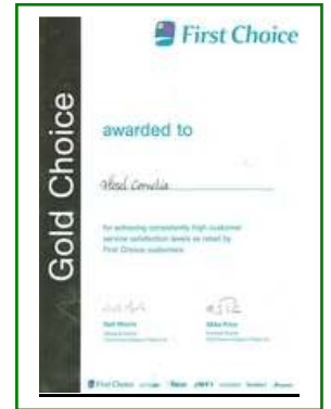
FIRST CHOICE – GOLD CHOICE