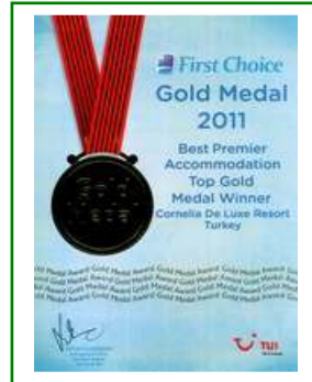
FIRST CHOICE – TOP GOLD MEDAL