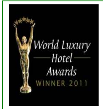
BEST LUXURY COASTAL RESORT