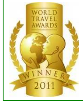
WTA – Europe's Leading Golf Resort