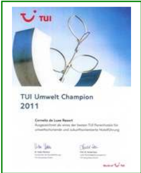
TUI – UMWELT CHAMPION