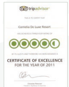
TRIPADVISOR – CERTIFICATE of EXCELLENCE