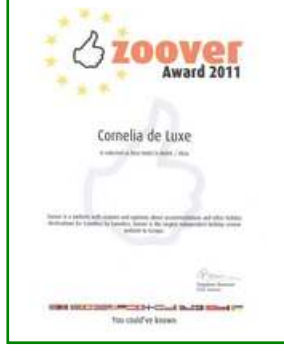
ZOOVER – BEST HOTEL BELEK