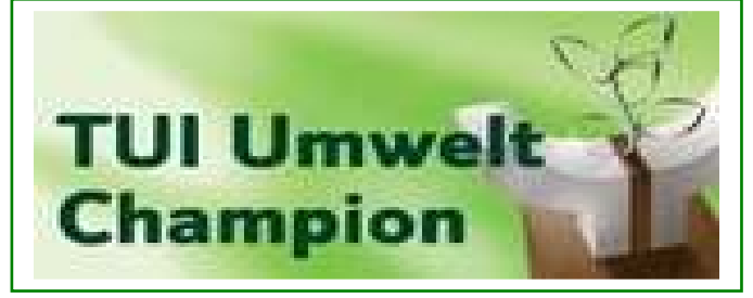
TUI – Environmentally Friendly TOP 100 Hotels Worldwide