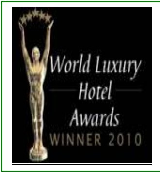
BEST LUXURY COASTAL HOTEL