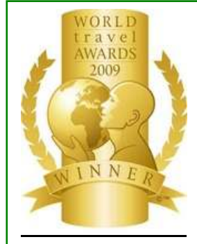
WTA – Turkey's Leading Golf Resort

İllerİbaşı Mevkii Çelik San. ve Turizm A.Ş. İLERİBAŞI MEVKİİ BELEK / ANTALYA / TÜRKİYE Tel : 0 242 710 15 00 / Fax : 0 242 715 25 05