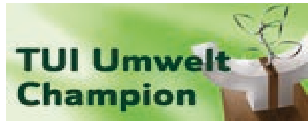
TUI – Environmentally Friendly TOP 100 Hotels Worldwide