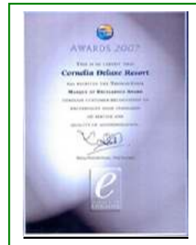
THOMAS COOK - MARQUE of EXCELLENCE