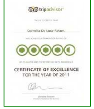
TRIPADVISOR – CERTIFICATE OF EXCELLENCE