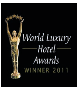
BEST LUXURY COASTAL RESORT