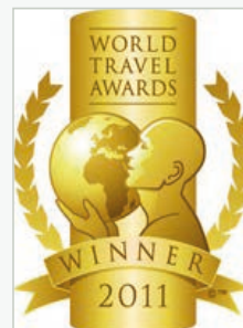
WTA – Europe's Leading Golf Resort