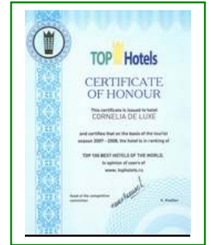
TOP 100 BEST HOTELS - CERT. of HONOUR