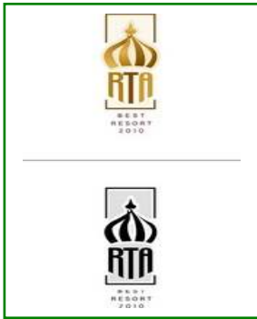
RUSSIAN TRAVEL AWARDS – Best Resort