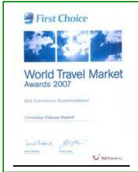
FIRST CHOICE – WORLD TRAVEL MARKET AWARDS