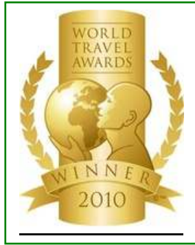
WTA – Europe's Leading Golf Resort