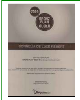
OTEL PUAN – BRONZE AWARD