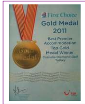
FIRST CHOICE - GOLD MEDAL