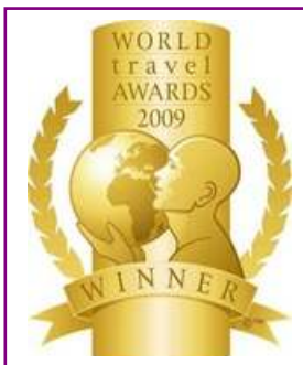
WTA - Europe's Leading Golf Resort