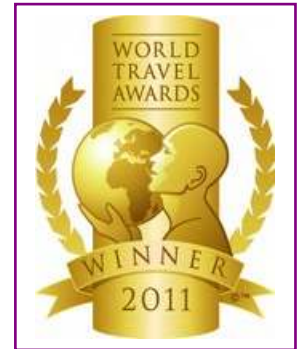
WTA - Europe's Leading Resort Villa