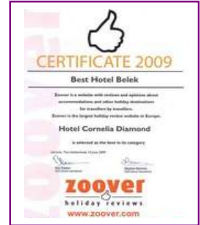
ZOOVER - BEST HOTEL BELEK