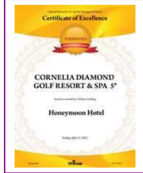
TOPHOTELS – Turkey's Leading Honeymoon