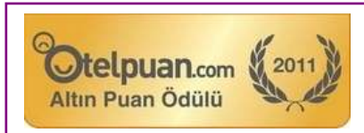
OTEL PUAN GOLD