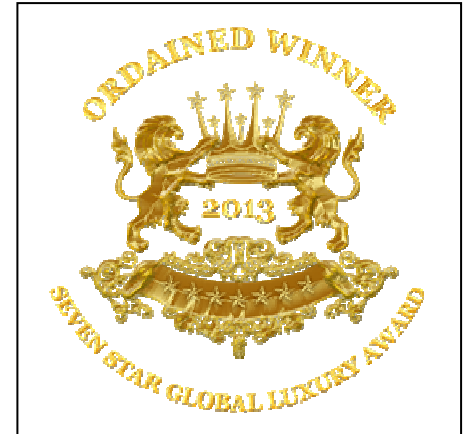
SEVEN STAR LUXURY AWARDS