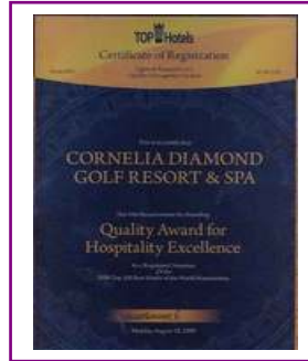
TOPHOTELS - AWARD for EXCELLENCE