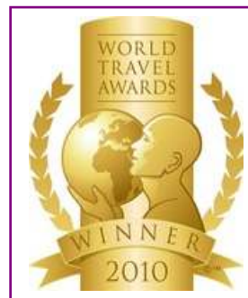
WTA - World's Leading All-Inclusive Golf Resort