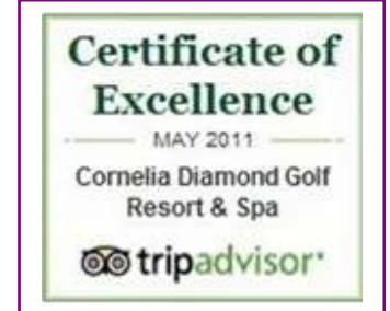
TRIP ADVISOR - CERTIFICATE of EXCELLENCE