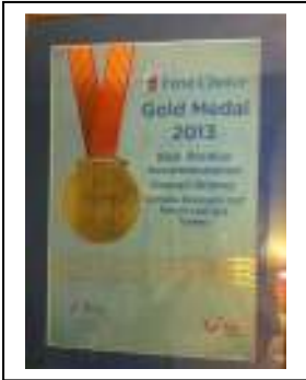
TUI UK – GOLD MEDAL OVERALL WINNER