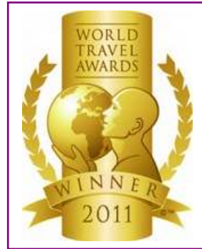
WTA - World's Leading Fully Integrated Resort