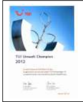
TUI – UMWELT CHAMPION