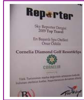
REPORTER MAG. - BEST SPA HOTEL