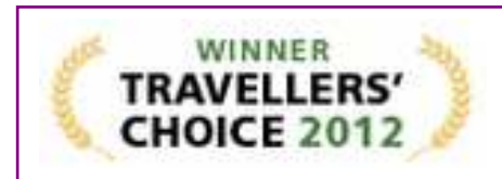
TRIPADVISOR - Top 25 All Inclusive Resorts in Europe