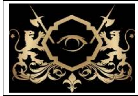
EUROPEAN BEST SPORT HOTEL 2012