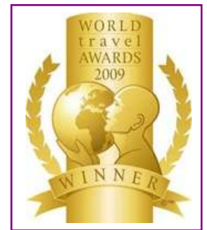
WTA - Europe's Leading Spa Resort