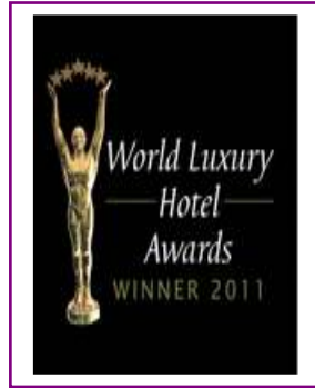
WORLD LUXURY - BEST LUXURY SPA RESORT