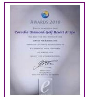
MARK for EXCELLENCE