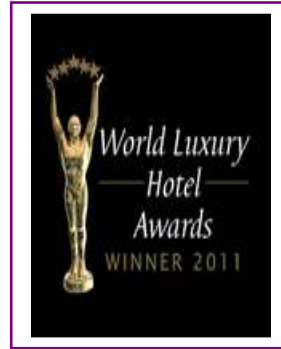
WORLD LUXURY - BEST LUXURY GOLF RESORT