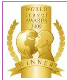
WTA - Turkey's Leading Spa Resort