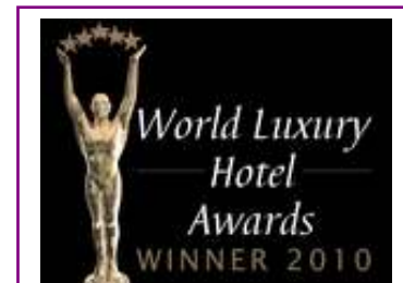
WORLD LUXURY - BEST LUXURY GOLF RESORT