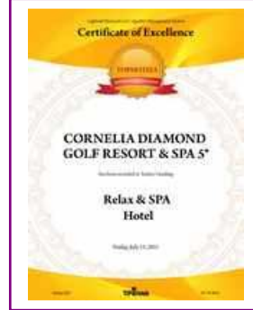
TOPHOTELS – Turkey's Leading Relax & SPA