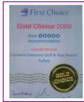
FIRST CHOICE - GOLD CHOICE