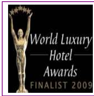
WORLD LUXURY - LUXURY GOLF RESORT