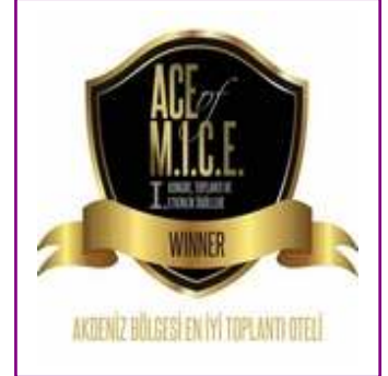
ACE of MICE – Best Congress Hotel in Antalya