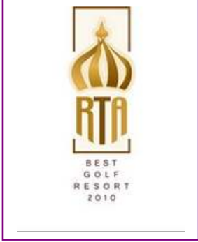
RUSSIAN TRAVEL AWARDS