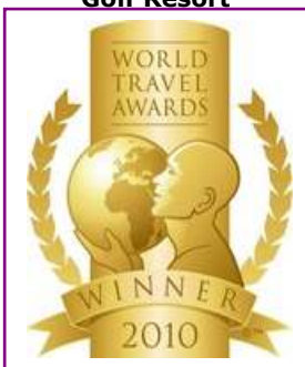
WTA - Europe's Leading Luxury Resort