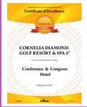
TOPHOTELS – Turkey's Leading Conference