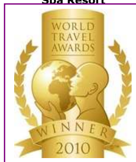
WTA - Europe's Leading Spa Resort