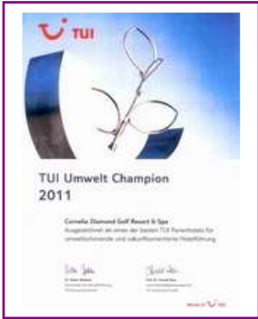
TUI - UMWELT CHAMPION