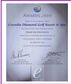
AWARD for EXCELLENCE