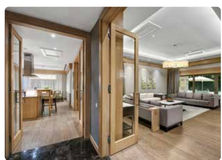
Living Room & Separate Kitchen

*Please ask your assistant for pool heating and cost information.