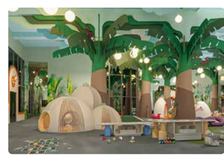
New Chuckles Kids Club