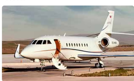
*Extra charges may apply

· Free of charge in-room breakfast service