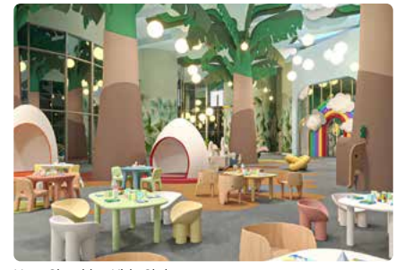
New Chuckles Kids Club