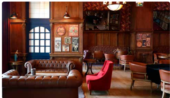
The Shamrock Irish Bar