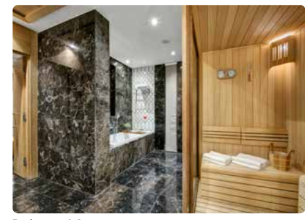
Bathroom & Sauna