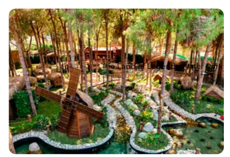
Ali Baba's Farm