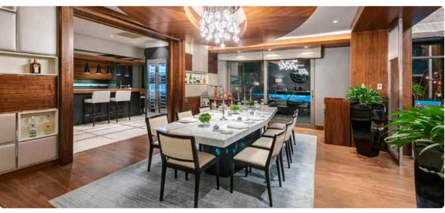
Kitchen & Dining Area