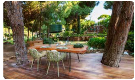
Uhon Thai Cuisine