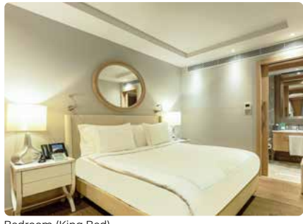
Bedroom (King Bed)