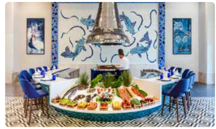
The Seahorse Seafood Bar & Grill