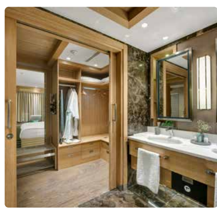
Dressing Room & Bathroom