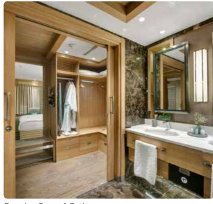
Dressing Room & Bathroom