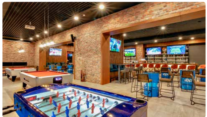
Score Sports Bar

*Wall's in UK / Inmarko in Russia /Langnese in Germany