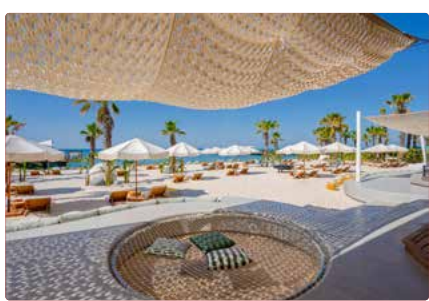
Alia Beach Club

Please note that beach facilities are officially open between May 1 through October 31.