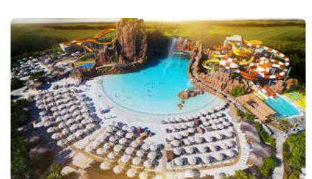
The Land of Legends Water Park