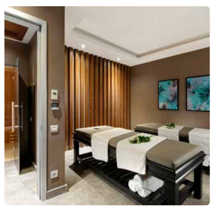
ving Room Massage Room & Sauna