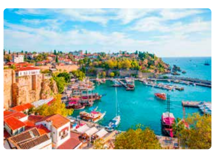
Old Town (Kaleiçi)