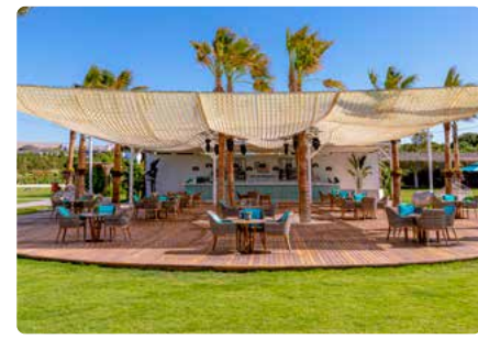
Palm Beach Club