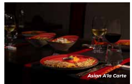
Asian A'la Carte