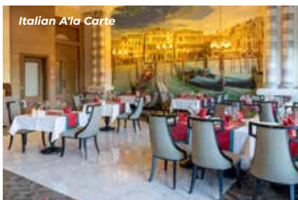
Italian A'la Carte

Operating days and hours of the restaurant and bar may change due to weather conditions, guest demand, and technical factors.