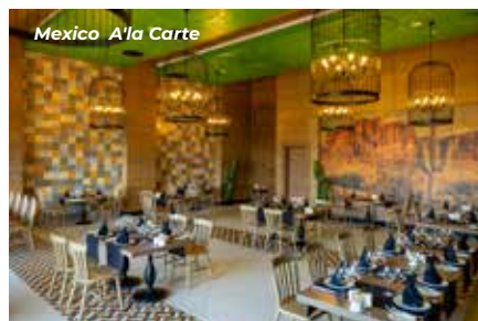
Mexico A'la Carte