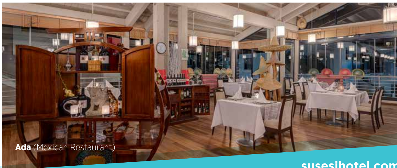
Ada (Mexican Restaurant)